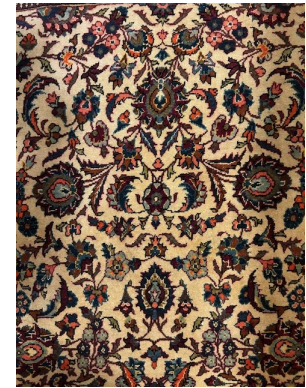
Crystal's Persian rug

Crystal still has many artifacts from Iran that show what Iran was like in the days